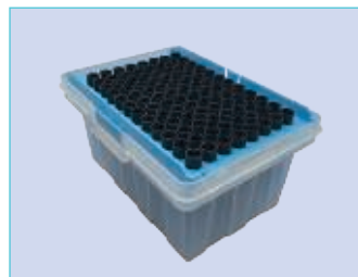
INDUCTIVE FILTER TIPS