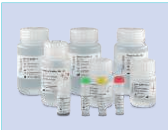
PATHOGENS (DGX) KIT 5 K, 25K