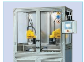
TUBE TRANSFER SYSTEM TTR

○ +31 (0) 85 - 200 7431 ○ info@molgen.com ○ www.molgen.com