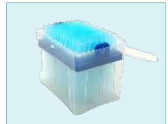
UNIVERSAL FILTER TIPS